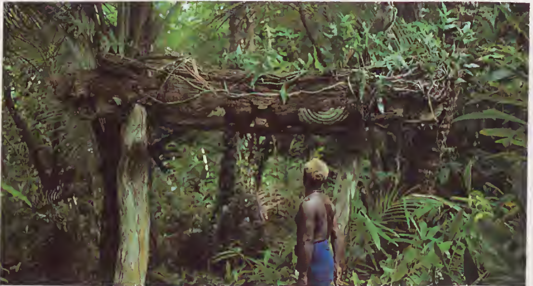
Plate I. A horizontal Curvunavunga malagan sculpture from Tabar, four metres long, hardwood.

After the peace was made the Curvunavunga malagans remained in village centres until they disintegrated or were sold to foreigners. If sold, the support posts would be left in the ground. One immense old fig tree near Datava village on Big Tabar Island still has a pair of posts amongst its roots, firmly planted in the ground. Local people said that these support posts were placed in the ground and consolidated by using strong magic associated with koravar ( Zingiber sp.) and lime. This consolidation had the effect of placing a taboo on the posts so that the relics would remain as evidence of the reconciliation for future generations.